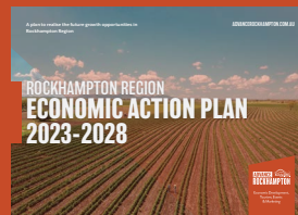
ECONOMIC ACTION PLAN 2023-2028